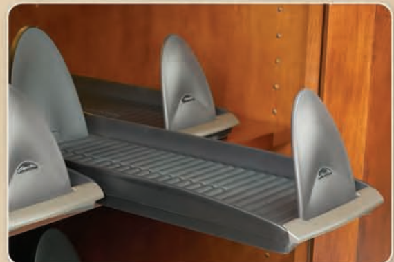
Trays look great even when pulled out or removed

800-STORALL (800) 786-7255 Fax (800) 786-3305 www.flipworks.com