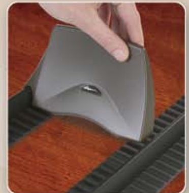
Pivot back support to adjust